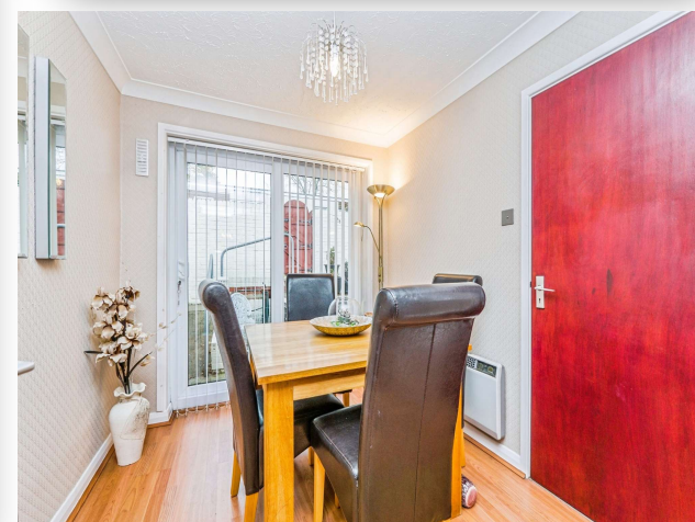
Chapel Wood, Llanedeyrn Cardiff CF23 9EH