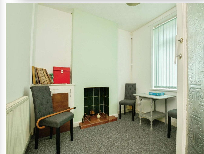
Galston Street,Adamsdown Cardiff CF24 0HR