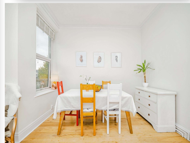
Connaught Road, Roath Cardiff CF24 3PY