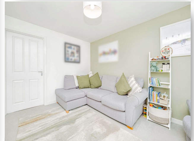
Rees Drive, Old St. Mellons Cardiff CF3 6AS