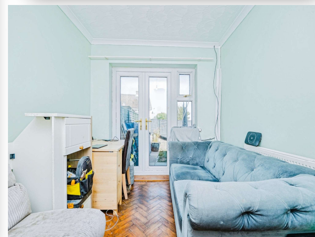
Penrhyn Close, Rumney Cardiff CF3 1RN