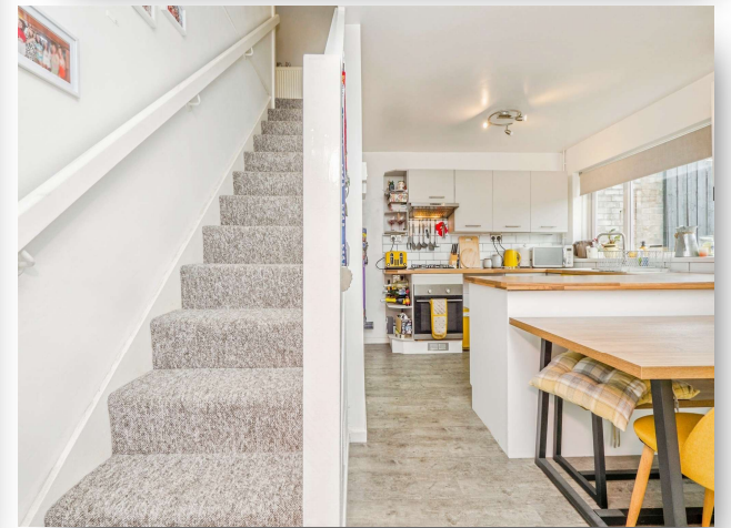
The Hawthorns, Pentwyn Cardiff CF23 7AQ