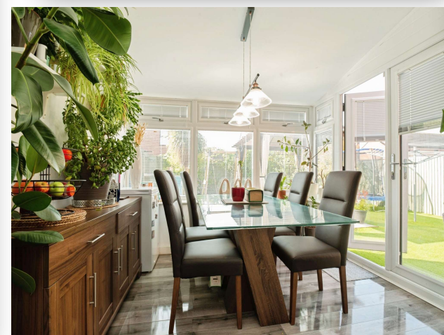
Captains Walk Clevedon Road, Llanrumney Cardiff CF3 4BE