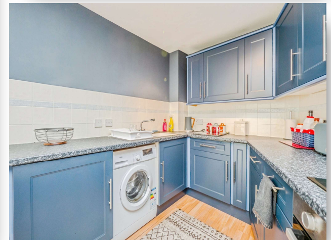
Oriel House Windsor Road, Cardiff CF24 2FY