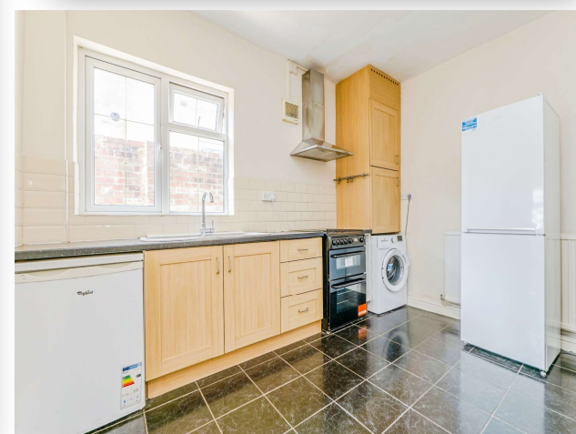
Tydfil Place, Roath Park Cardiff CF23 5HP