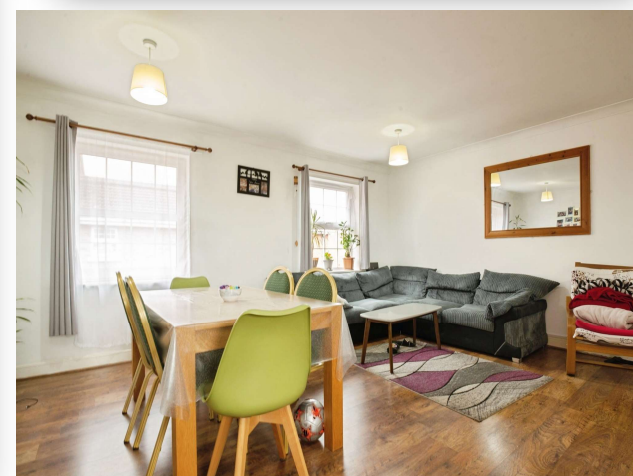
Page Drive, Windsor Village Cardiff CF24 2TU