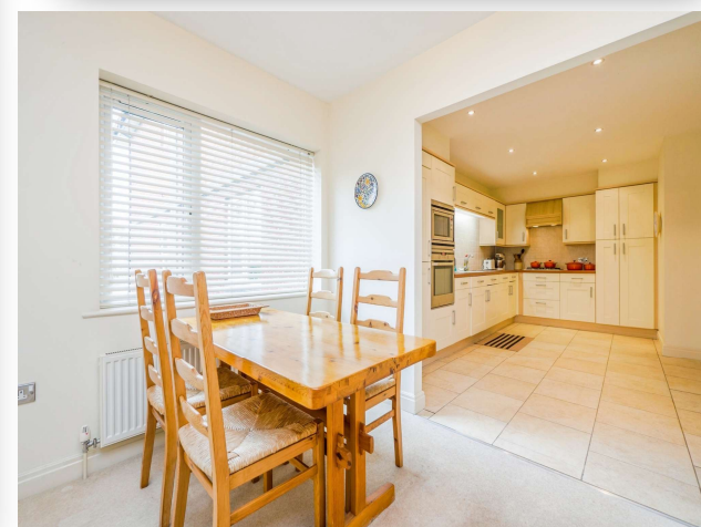
Worcester House Cyncoed Gardens, Cyncoed Cardiff CF23 5SL