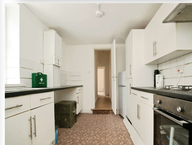
Moira Street,Adamsdown Cardiff CF24 0EQ