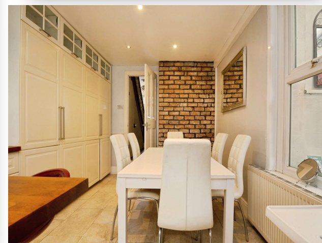
Montgomery Street, Roath Park Cardiff CF24 3LZ