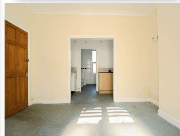
Topaz Street, Adamsdown Cardiff CF24 1PG