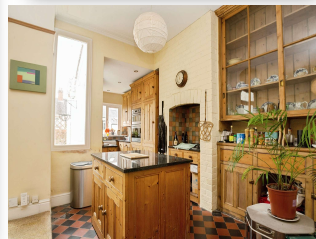
Amesbury Road, Penylan Cardiff CF23 5DX