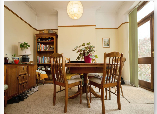
Amesbury Road, Penylan Cardiff CF23 5DX