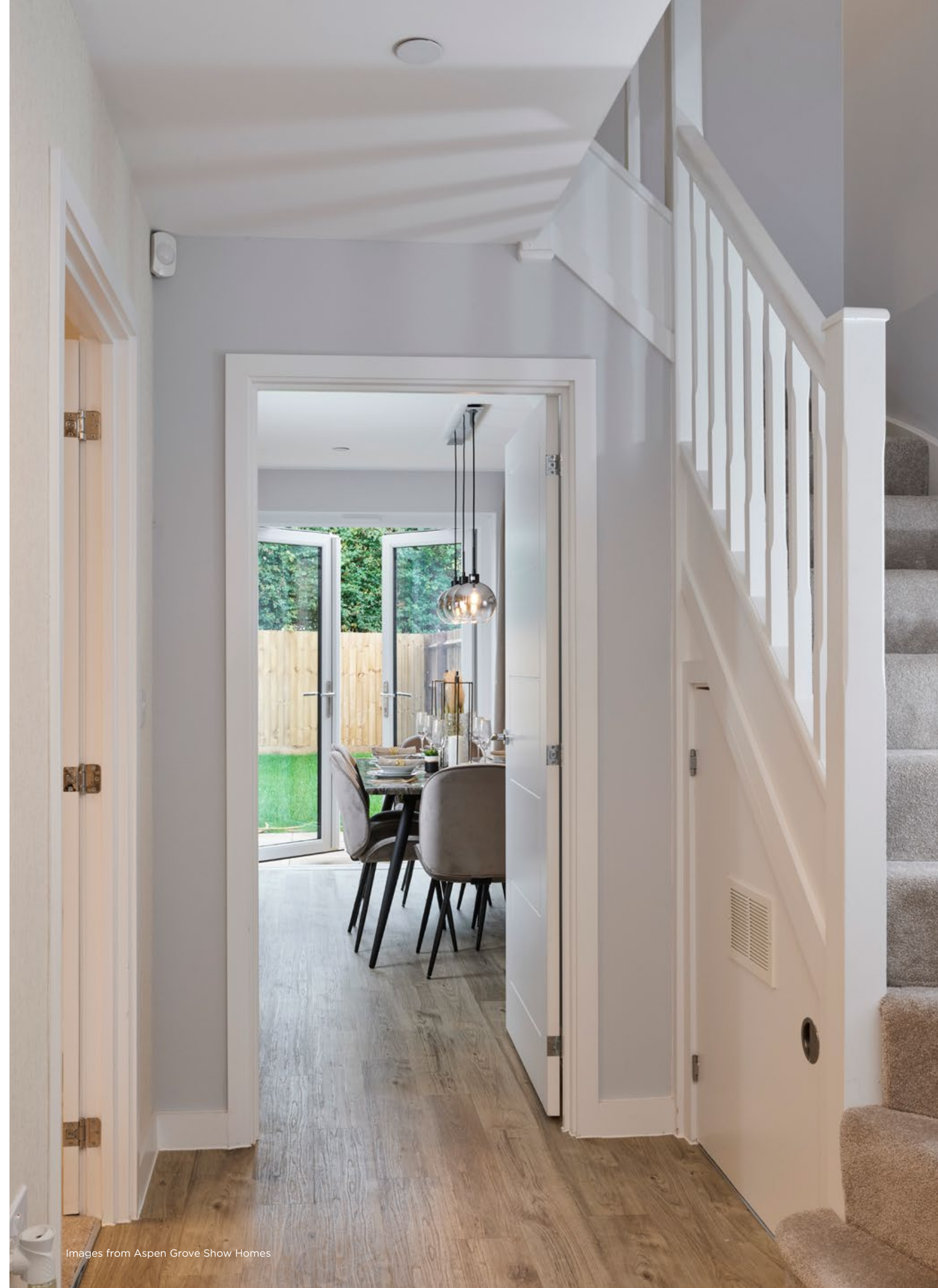
Images from Aspen Grove Show Homes