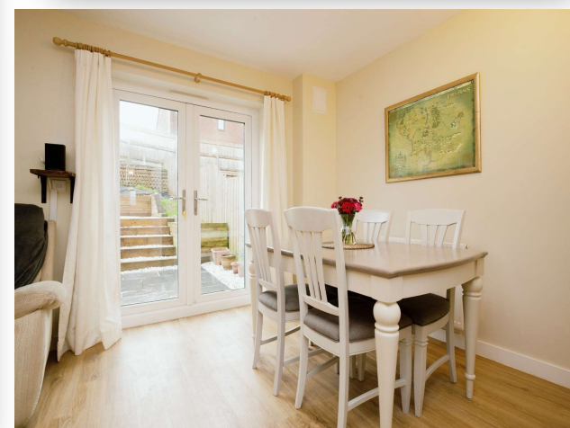
Captain's View Braunton Crescent, Llanrumney Cardiff CF3 5AD