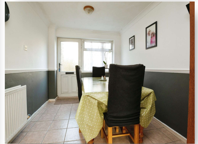
Chapel Wood, Llanedeyrn Cardiff CF23 9EJ