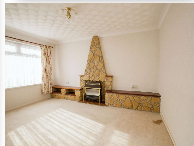
Coed-Y-Gores, Llanedeyrn Cardiff CF23 9NP