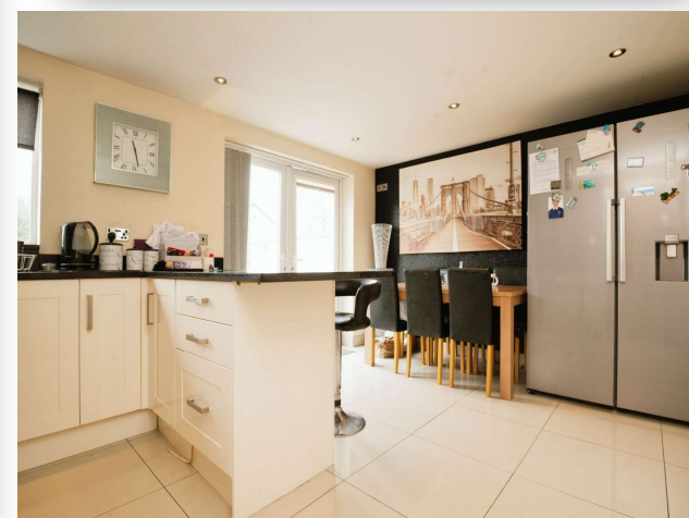
Coeden Dal, Pentwyn Cardiff CF23 7DL