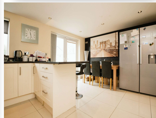
Coeden Dal, Pentwyn Cardiff CF23 7DL