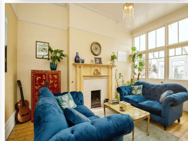
Waterloo Road, Penylan Cardiff CF23 5AE