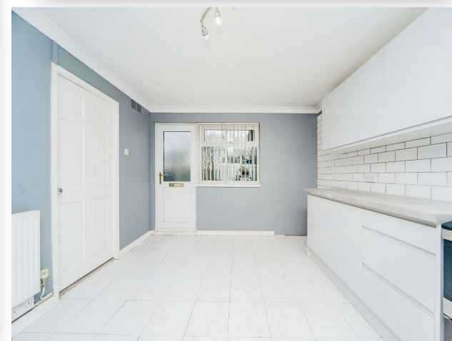
Chapel Wood, Llanedeyrn Cardiff CF23 9EL