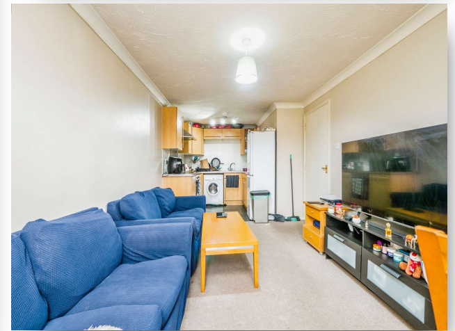
Beaufort Square, Windsor Village Cardiff CF24 2TX