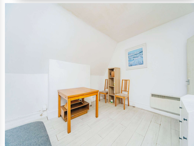
Second Floor Flat Connaught Road, Roath Cardiff CF24 3PT