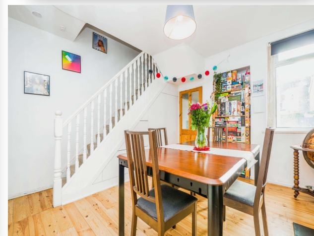
Aberdovey Street, Splott Cardiff CF24 2ER