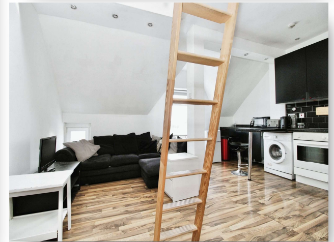
Newport Road, Roath Cardiff CF24 1RR