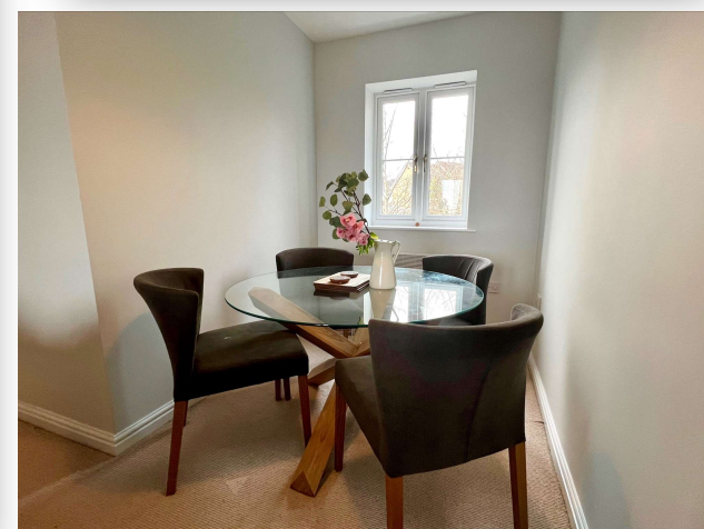
Rowsby Court, Pontprennau Cardiff CF23 8FG