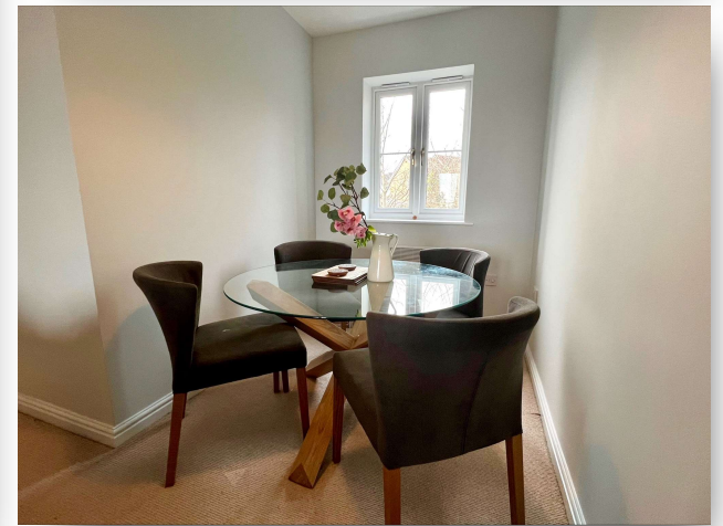
Rowsby Court, Pontprennau Cardiff CF23 8FG