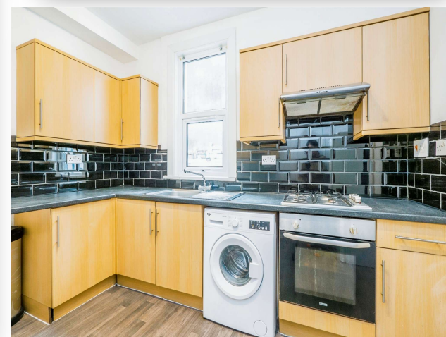
Moorland Road, Splott Cardiff CF24 2LP