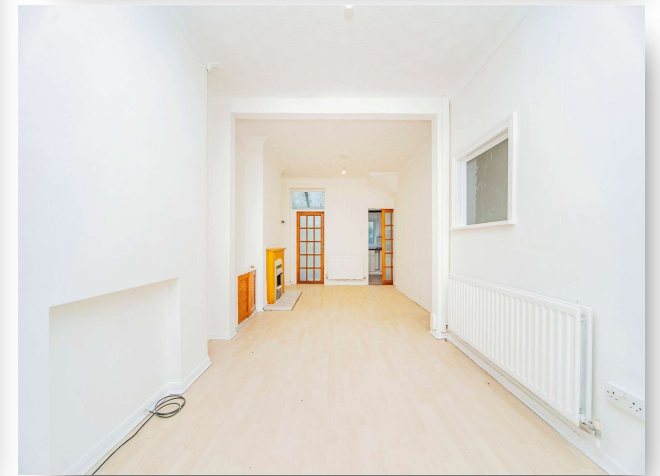
Glenroy Street, Roath Cardiff CF24 3LA