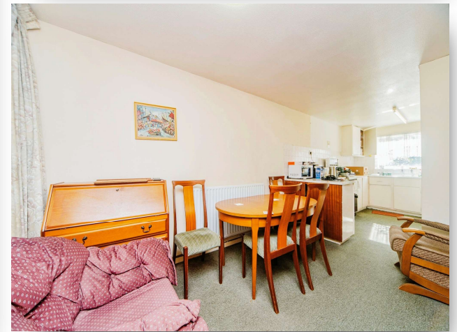
Chapel Wood, Llanedeyrn Cardiff CF23 9EJ