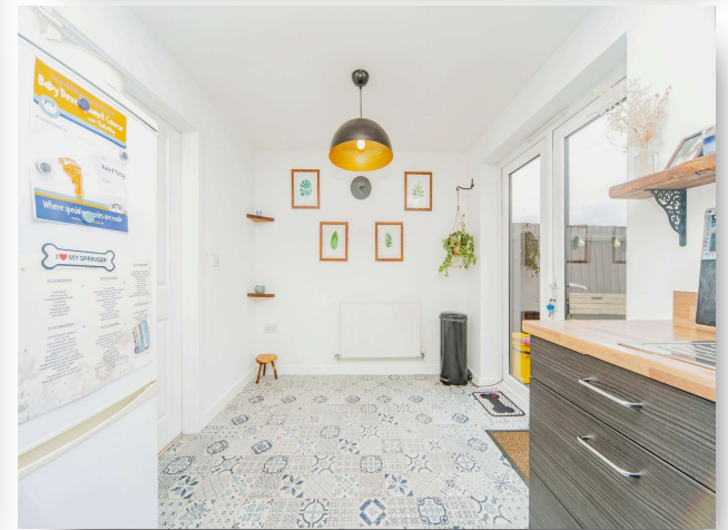
Heol Booths, Old St. Mellons Cardiff CF3 6WA