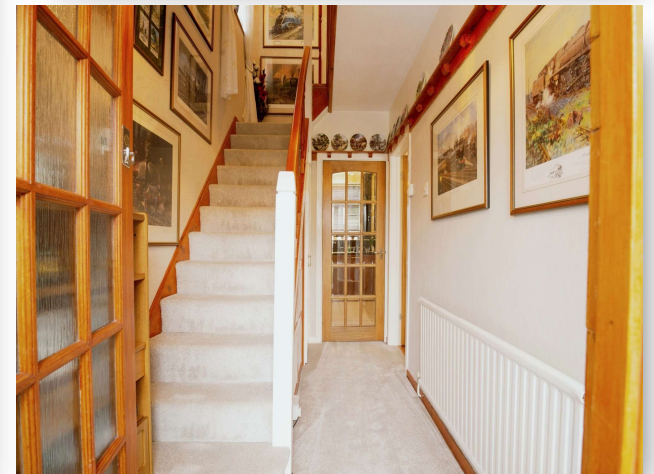
Dan-Y-Coed Close, Cyncoed Cardiff CF23 6NJ