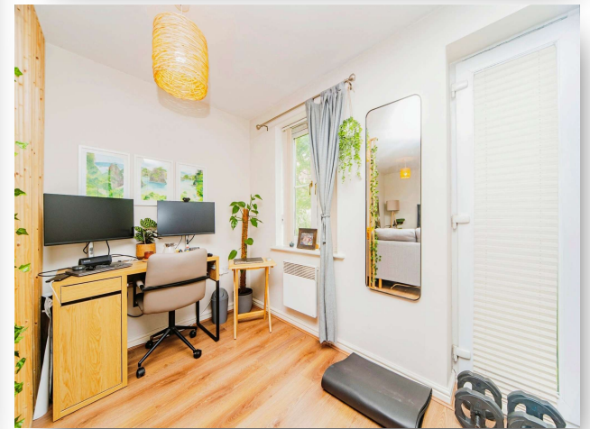
Rowsby Court, Pontprennau Cardiff CF23 8FG