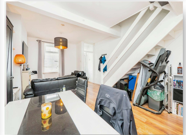
Kerrycroy Street, Splott Cardiff CF24 2AQ