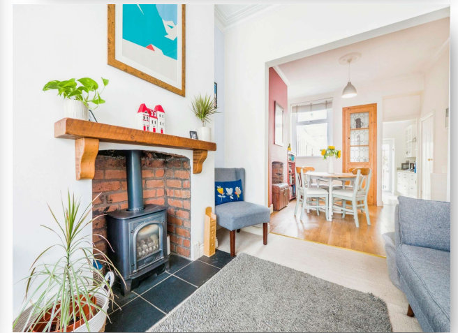
Inverness Place, Roath Cardiff CF24 4RX