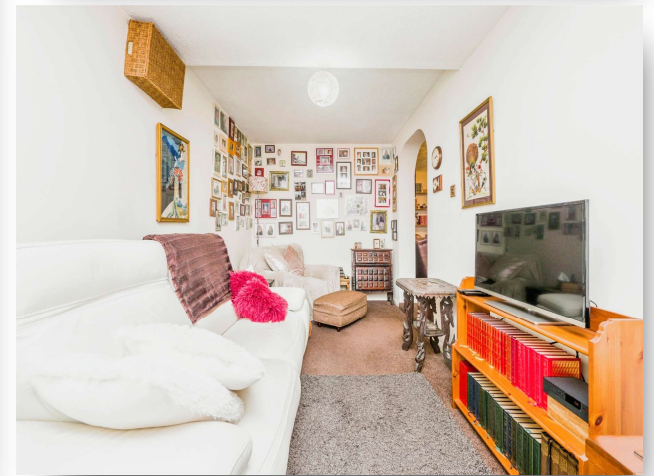
Hastings Crescent, Old St. Mellons Cardiff CF3 5DF