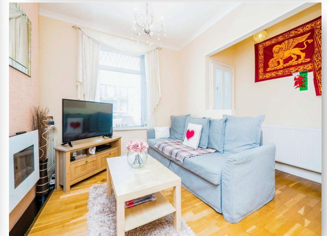
Harriet Street, Cathays Cardiff CF24 4BW