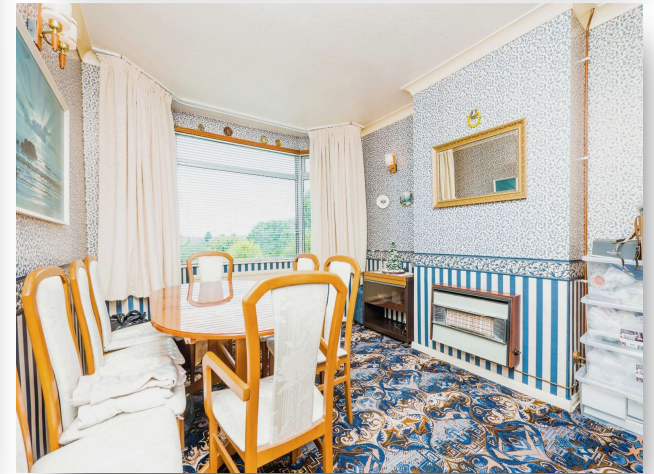
Glastonbury Terrace, Llanrumney Cardiff CF3 4HB