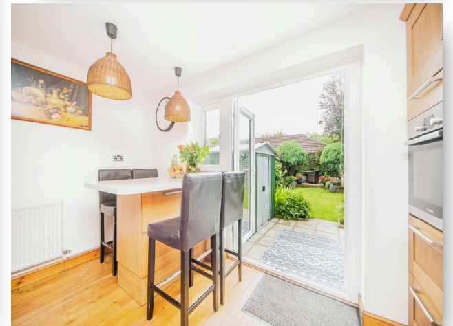
Beckgrove Close, Pengam Green Cardiff CF24 2SE