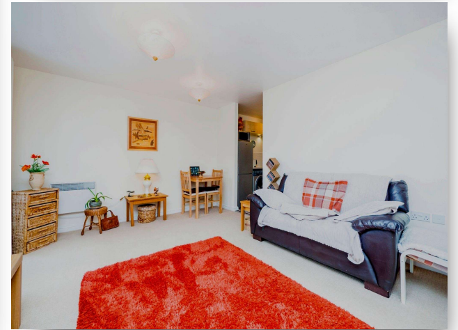
Rowsby Court, Pontprennau Cardiff CF23 8FG