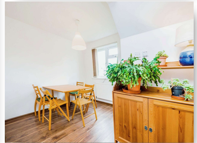
Jasmine Drive, St. Mellons Cardiff CF3 0JD