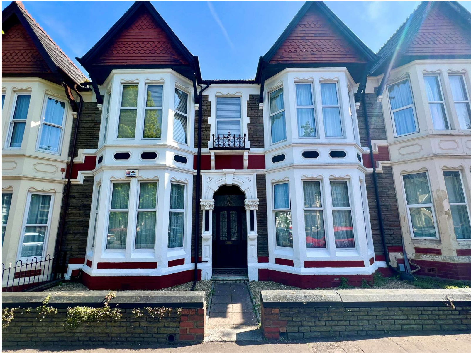
Shirley Road, Roath Park Cardiff CF23 5HN