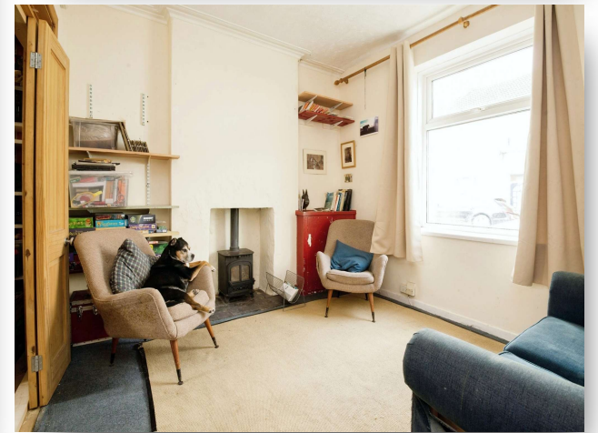
Arthur Street, Roath Cardiff CF24 1QR