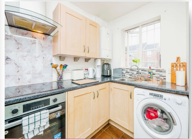
Harrison Drive, St. Mellons Cardiff CF3 0PJ