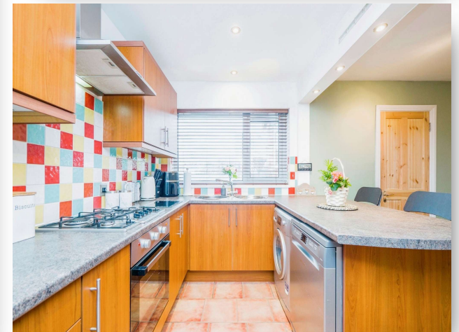
The Hawthorns, Pentwyn Cardiff CF23 7AS