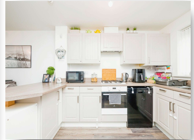
Eastside Quarter Maelfa, Llanedeyrn Cardiff CF23 9PN