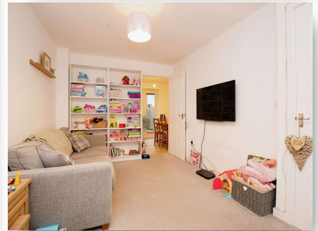
Eastside Quarter Maelfa, Llanedeyrn Cardiff CF23 9PN